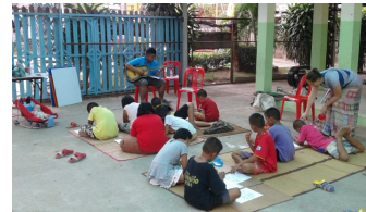
Children's Club in Baan Naa Waa